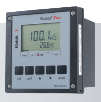
Stratos Eco 2405 Cond