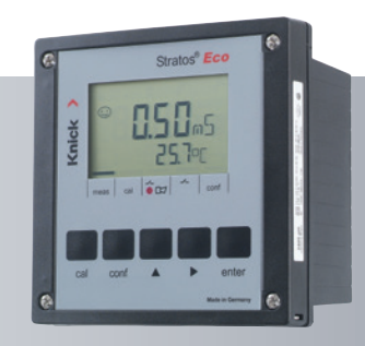
Stratos Eco 2405 Condl