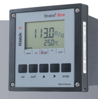
Stratos Eco 2405 Oxy