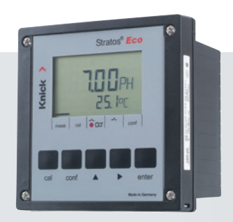
Stratos Eco 2405 pH